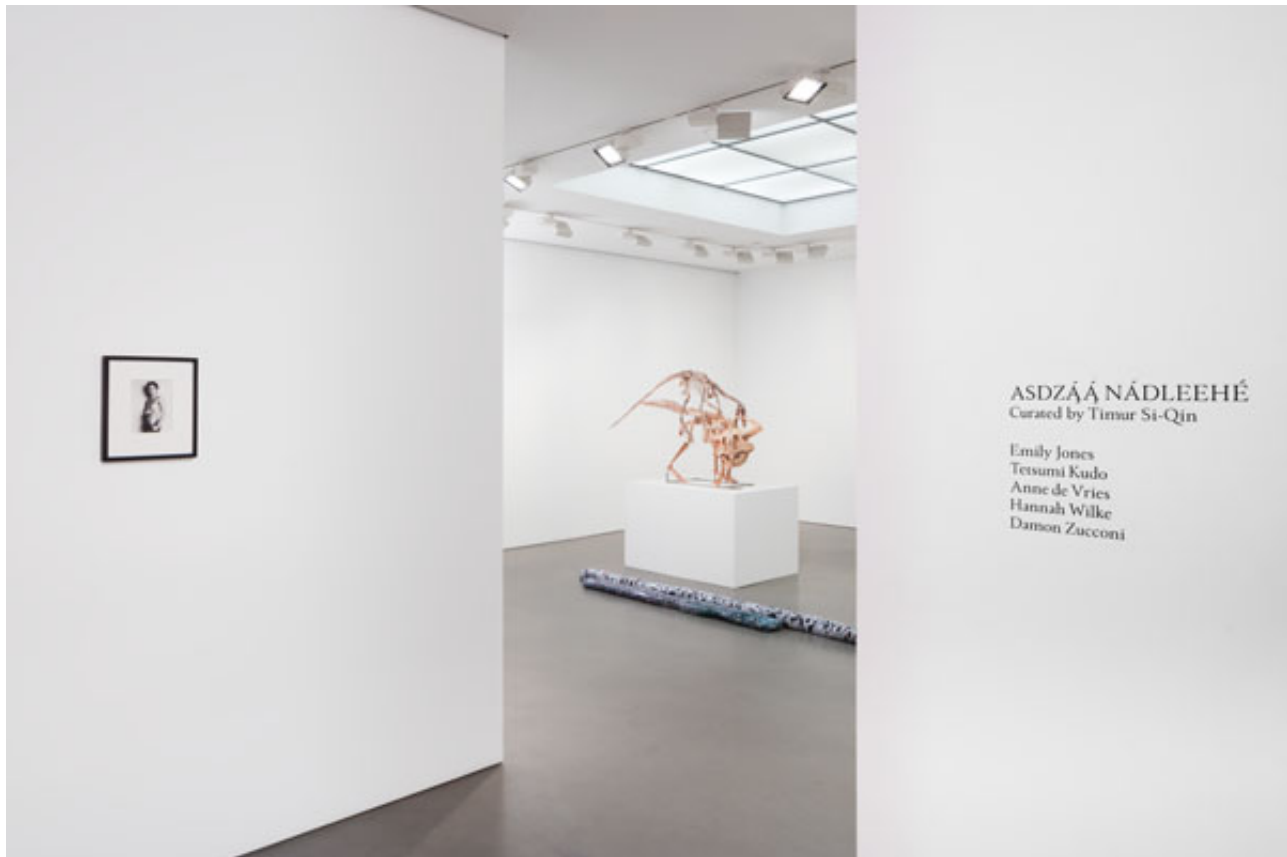
Installation view: Asdzáą Nádleehé curated by Timur Si-Qin.

Organized by Timur Si-Qin at Andrea Rosen Gallery , the group exhibition Asdzáą Nádleehé (Changing Woman) is an ambitious display of varying capabilities of artistic production.