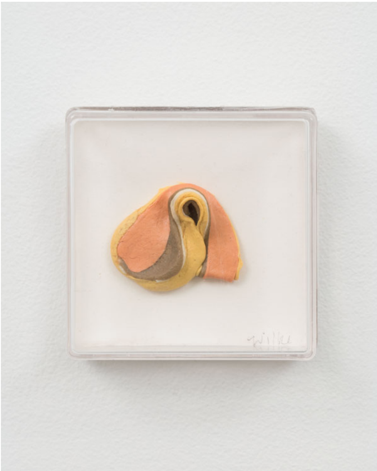
Hannah Wilke, Untitled (Single Gum Sculpture) , c. 1975, Gum in plexiglas box, 2 1/2 x 2 1/2 x 1 inches, Plexi box: 2 5/8 x 2 5/8 x 1 1/8 inches. Courtesy Andrea Rosen Gallery, New York (C) The Estate of Hannah Wilke. Photo: Pierre Le Hors.